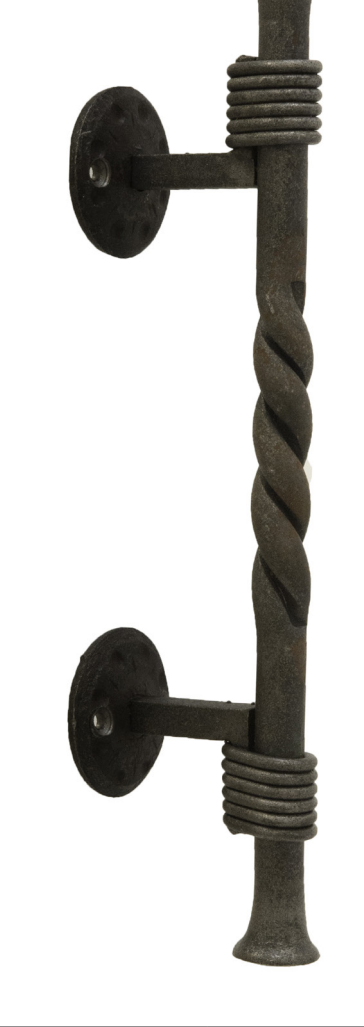
Product Description: 3/4" Solid Round Hand Forged Grip with Twisted Center, Coil Rings, Straight Mounts and Decorative Rosettes in Steel