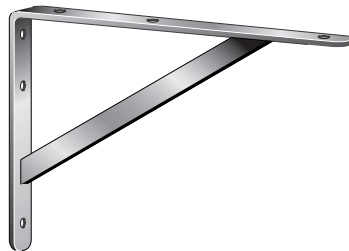
208 Series Ultimate L-Bracket™