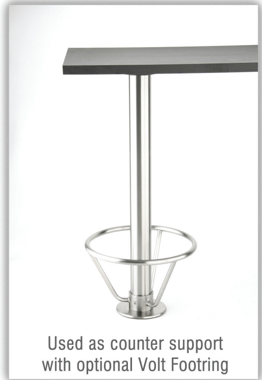
Used as counter support with optional Volt Footring