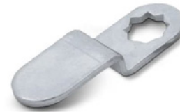
OFFSET CAM 1-1/2" offset cam