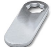
STRAIGHT CAM 1-1/2" straight cam