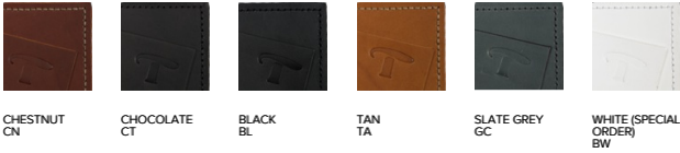
CHESTNUT CN | CHOCOLATE CT | BLACK BL | TAN TA | SLATE GREY GC | WHITE (SPECIAL ORDER) BW