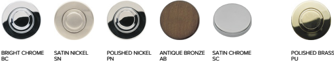
BRIGHT CHROME BC | SATIN NICKEL SN | POLISHED NICKEL PN | ANTIQUE BRONZE AB | SATIN CHROME SC | POLISHED BRASS PU